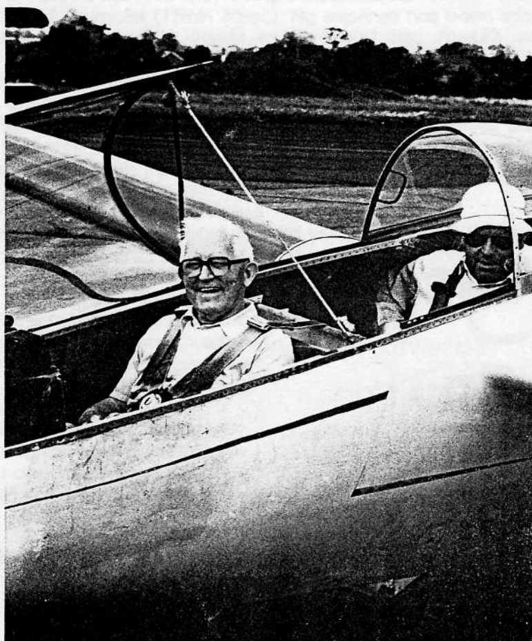
1991 AGONY RUN RAFFLE PRIZE GLIDER FLIGHT OVER VILLAGE